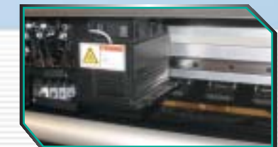
Precision Rail & Carriage, to provide accurate placement of dots.