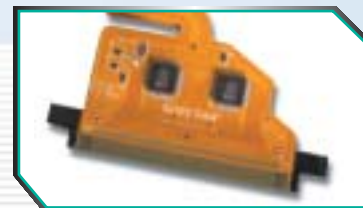
Spectra industrial grade print head technology. Applies the smallest drop configuration, SE-128, capable of producing the finest details in indoor and outdoor graphics.