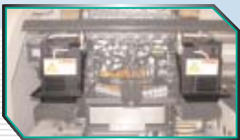
2 UV lamp curing systems, one on each side of the print head assembly, designed to provide consistent bi-directional printing and complete curing of the inks immediately after printing.