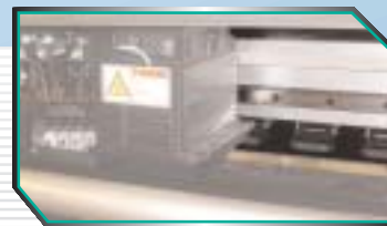
Precision Rail & Carriage, to provide accurate placement of dots.